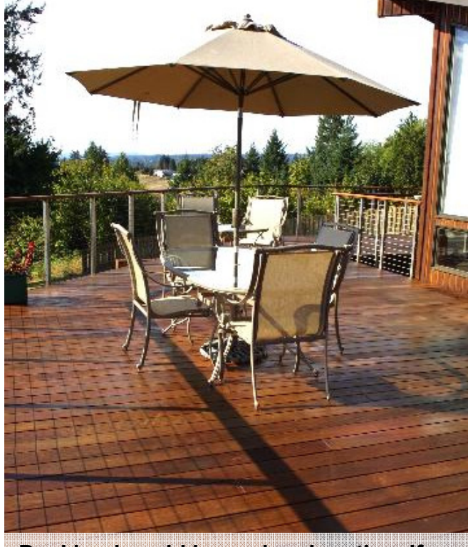
Decking is sold in random lengths. If we can accommodate your specified length requirements we will, but it is not always possible.